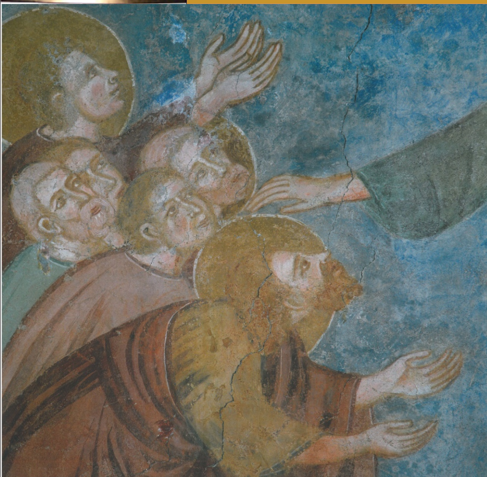
Christ and the Apostles. Detail from the Frescoes with Episodes from the Life of Christ. Church of Santa Margherita (c. 13th century), Laggio di Cadore (Belluno, Italy).