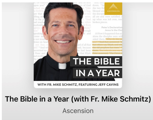
The Bible in a Year (with Fr. Mike Schmitz) Ascension