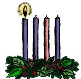
First Sunday in Advent